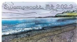
2023 Swampscott Recreation Parking Sticker

Recreation beach parking stickers are for use by residents only. Recreation parking stickers are required for anyone wishing to park at Preston Beach, Phillips Beach, Whales and Eismans Beaches. Stickers also cover one side of Columbia Street area near the train station. No sticker is needed for Fisherman's Beach or King's Beach on Humphrey Street.