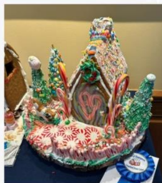
BEST HOLIDAY SPIRIT THE FEINSWOG FAMILY