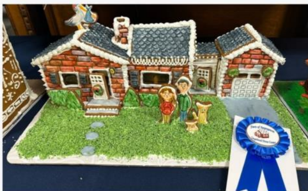
MOST CREATIVE THE MILLERS