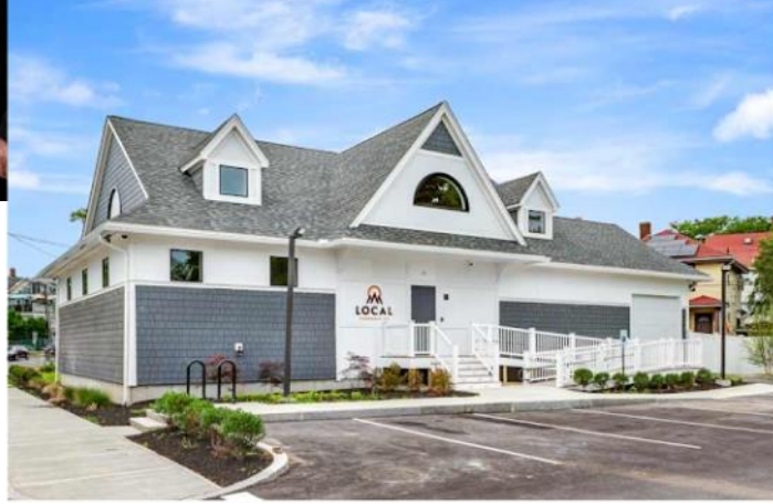
New Local Cannabis Co. at 16 Ocean Avenue