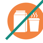
Plastic lined paper cups and cartons