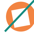
Styrofoam (bring to styrofoam drop-off days)