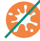
Food or drink (Rinse containers)