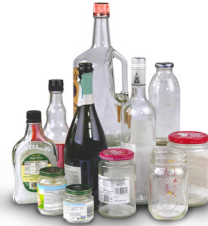
Bottles & Jars