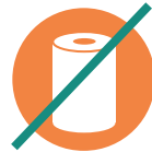
Paper towels & toilet paper