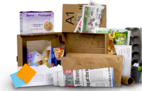
Mixed Paper, Newspaper, Magazines, Boxes (flattened)