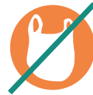
Plastic bags (Return to select retailers)