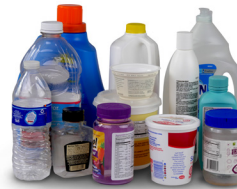
Bottles, Jars, Jugs, & Tubs (if possible, with caps)