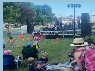
Summer Concert Series