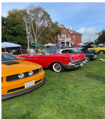
Annual Car Show

Town-sponsored recreation programs can be found on the Swampscott recreation website and via the Town website .