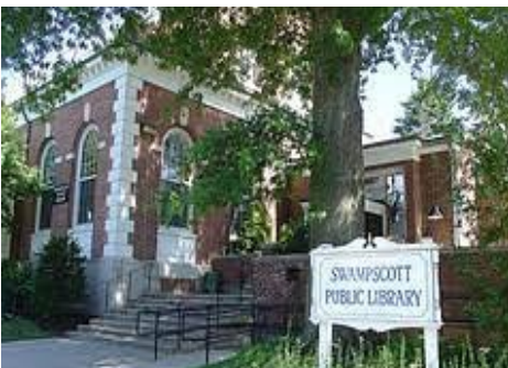
Swampscott Public Library

Offering ocean views from the reading room and a collection that began in the months after Swampscott first