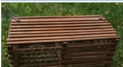
THE FIRST LOBSTER TRAP

Ebenezer Thorndike invented the first lobster trap in Swampscott in 1808