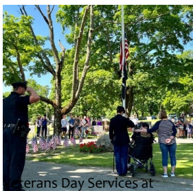
Veterans Day Services at Swampscott Cemetery

At the gateway to Swampscott, our Monument Square and Mall area honors local veterans from the Civil War,