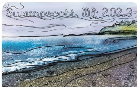
Swampscott Recreation Parking Sticker 2023

No sticker is needed for Fisherman's or King's Beach on Humphrey Street.