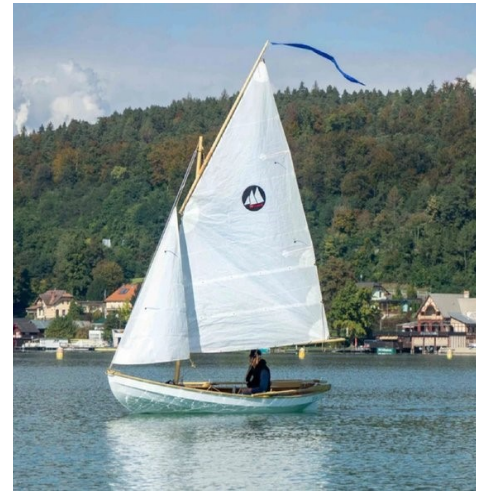
THE SWAMPSCOTT DORY

This iconic boat, still used widely today, was invented by Swampscott fisherman Theophilus Brackett