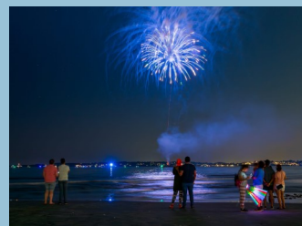
4th of July Fireworks