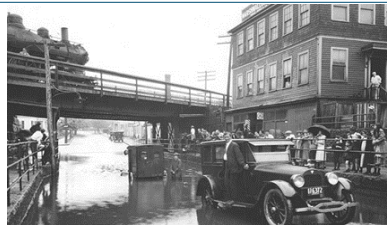
THE FIRST MARSHMALLOW FLUFF FACTORY

Ebenezer Thorndike invented the first lobster trap in Swampscott in 1808