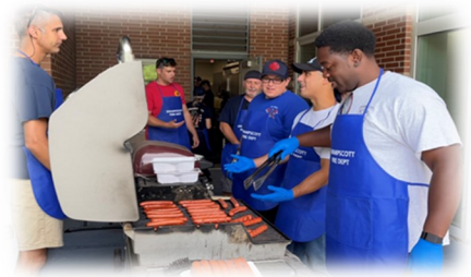
Senior Center Cookout