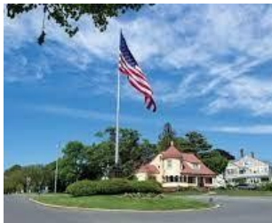
Monument Square & Mall

Swampscott is a vibrant community that has a rich heritage and many accessible amenities. There are local shopping areas on Humphrey Street and at Vinnin Square and a commuter rail providing service between Boston and Newburyport.